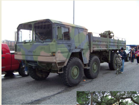
Current Military Vehicles