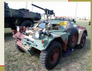
Ferret Armored Car