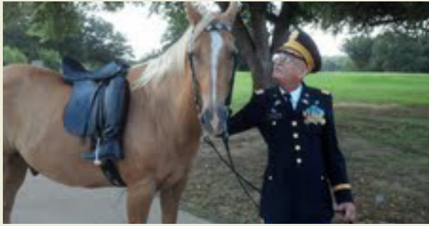
Riderless Horse Military Honor