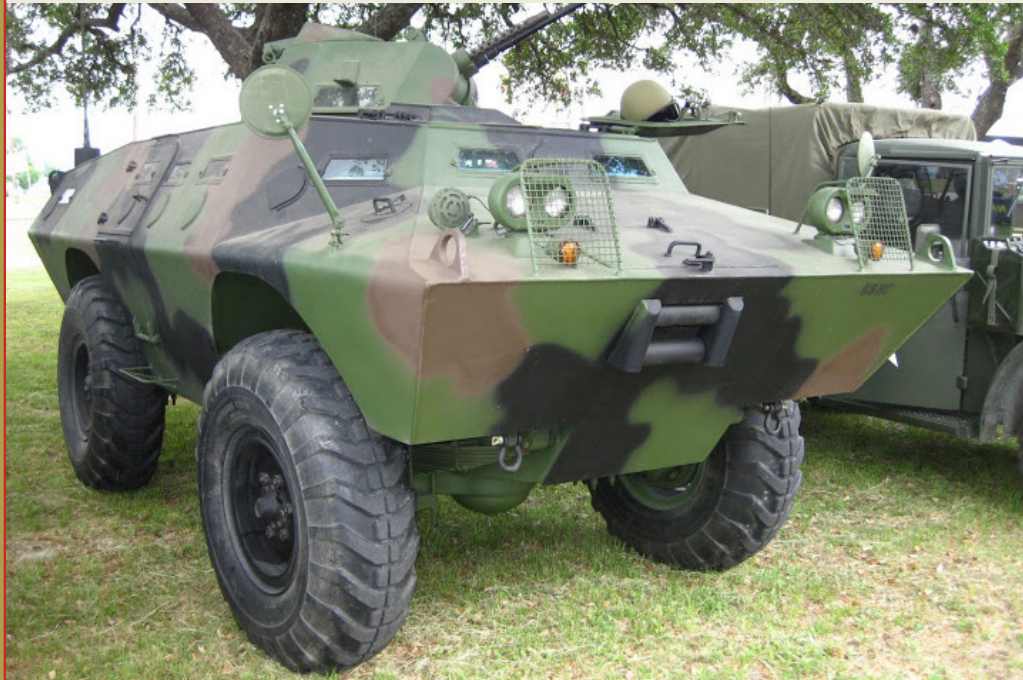
V100 Armored Car