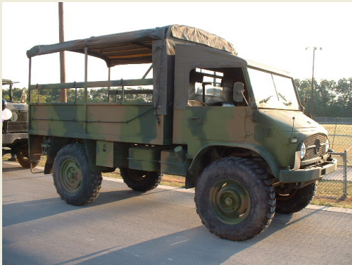
Foreign Military Vehicles